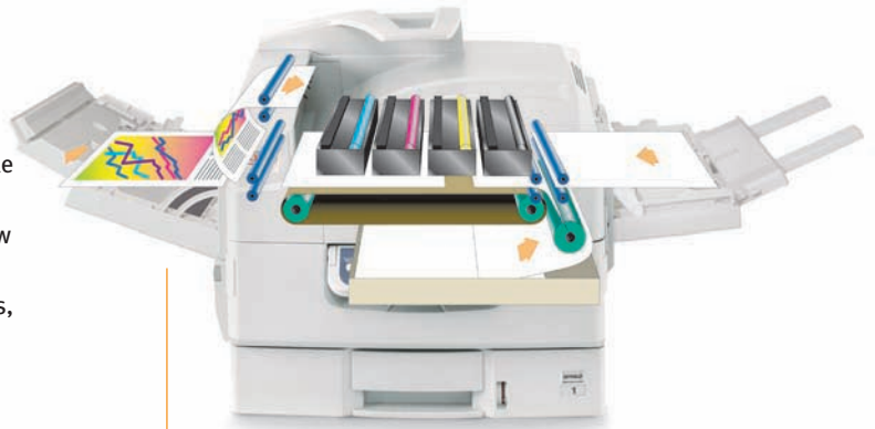
Single Pass Color™ technology and straight-through paper path handles thick paper stock and banner sheets.

The pro905DP from Oki Data Americas Inc.: high capacity and high quality—the right Digital Press for your demanding, color-sensitive short-run printing needs.