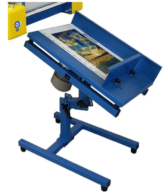
Optional Jogger 400

*Important - The machine must be operated with either a Reception Unit or a Jogger.