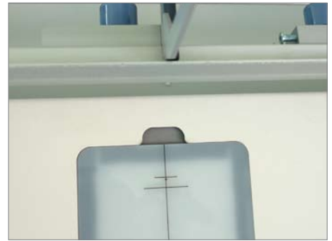
Registration marks for thicker and thinner materials