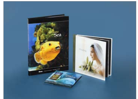
Professional customized hard covers and cases

3 mm spine guides with 8 mm spacers are included. Optional accessories: Corner Cutter, Side/Back Guide.